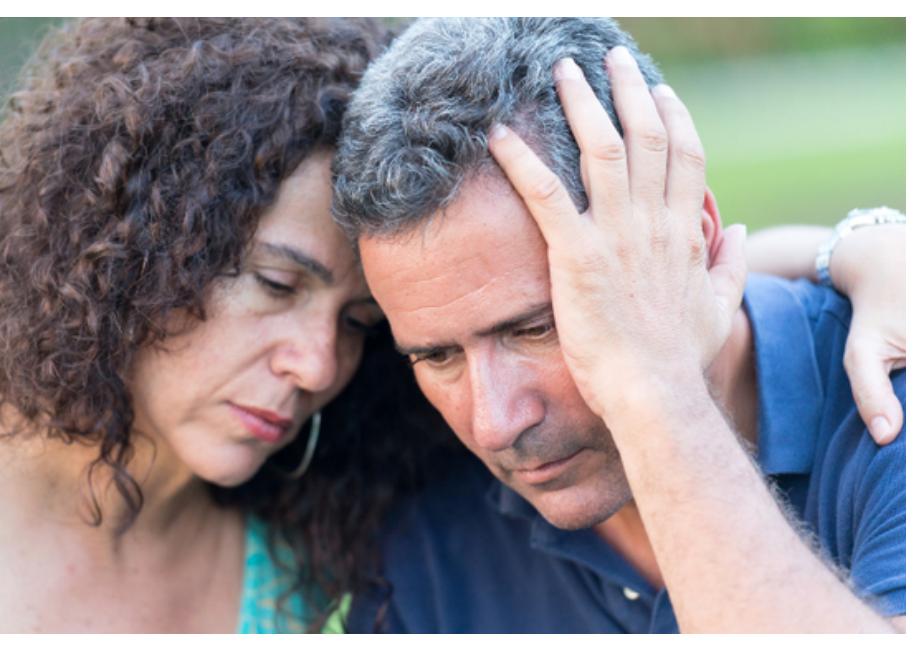
Is someone you love destroying family harmony?